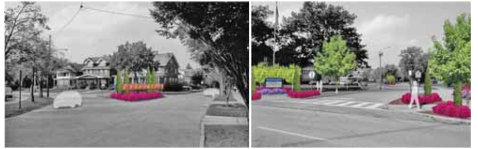
An artist's rendering of some of Larchmere's proposed streetscape improvements.

The project is a major effort to upgrade the Larchmere commercial district. It will enhance the commercial district with aesthetic improvements that also strengthen bicycle, pedestrian and transit access. It will have a major economic impact on residents and businesses within the Larchmere-Shaker Square community, as well as the entire Northeast Ohio region, by making the retail district safer, more attractive and more economically competitive.