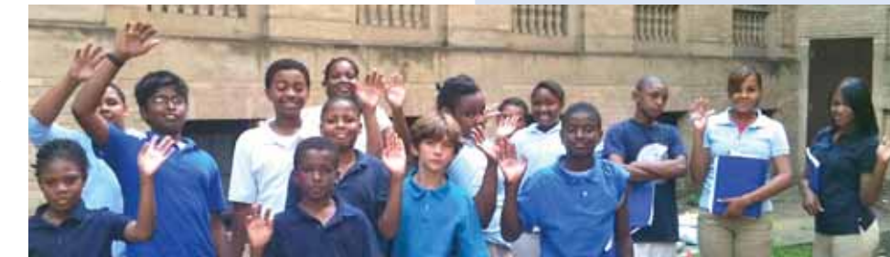
The Intergenerational School educates and involves children in the community. This spring, TIS students are working with Judson residents and CWRU on projects focused on water and sustainability.

Continuing the theme of sustainability, the newly-inaugurated Edible Forest Garden