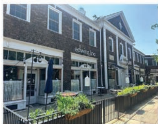
13108-13228 Shaker Square, {Shaker Square}