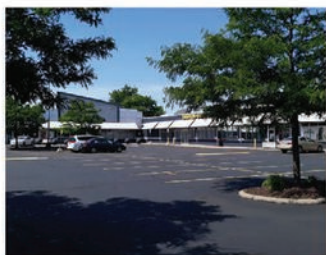
2488-2504 E. 40th St, {Arbor Park Place}