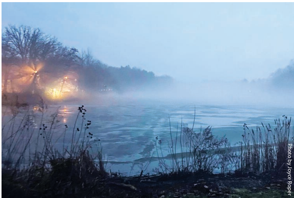
Lights cast a mysterious glow on a foggy Lower Shaker Lake in this view looking eastward in January.