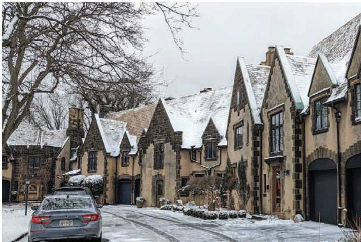
Belgian Village is a 1930s retreat hidden between Fairhill Road and the Doan Brook Gorge.