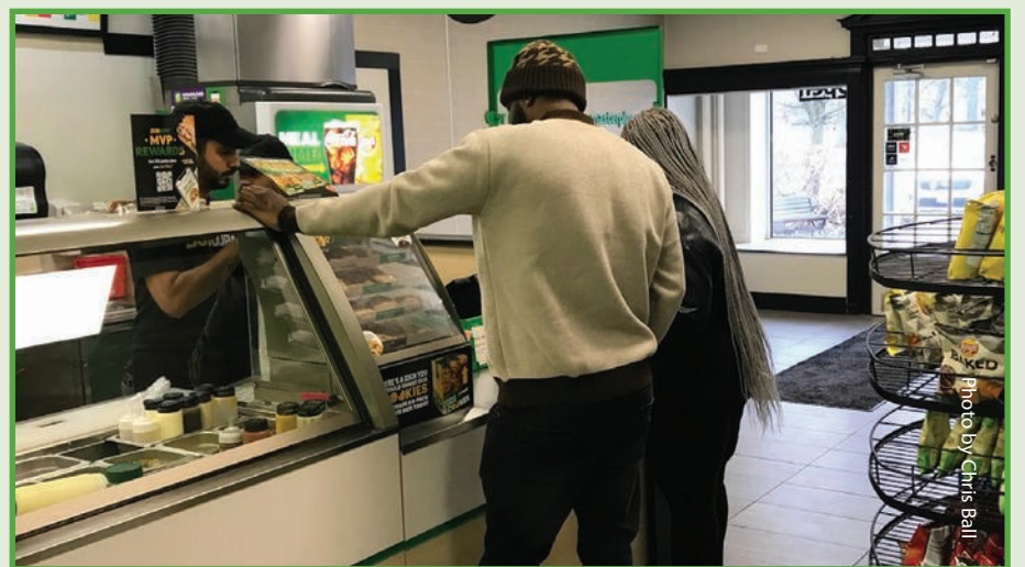
Daylight pours in the four new front windows in the Subway sandwich shop on Shaker Square. They were replaced Jan. 28 after being boarded up for a month when the shop was broken into four times during Christmas week.

See String of break-ins rattles Shaker Square, page 9