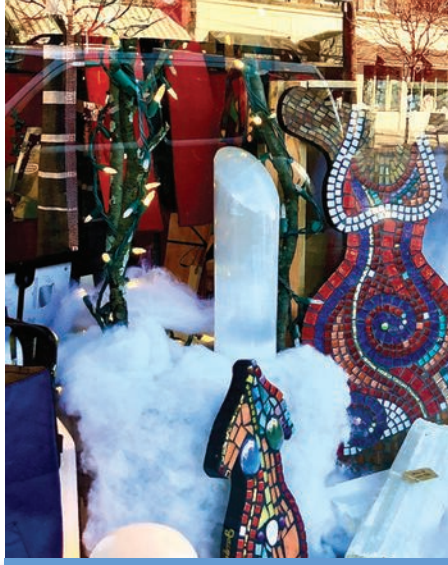
Fiddlehead art pieces