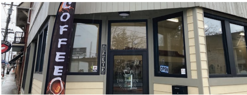
Start your day with coffee and pastry at The Tavern Coffee House, which opened in September at 12302 Buckeye Road.

This story ran in Signal Cleveland at tinyurl.com/lyucsatwm . Used with permission.