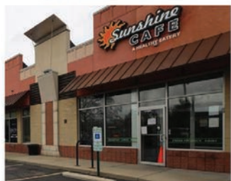
7201 Kinsman Rd, Cleveland, OH 44104

Reach out to inquire about lease terms and rate