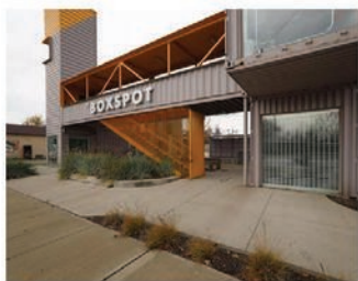
8005 Kinsman Rd {Boxspot}

Perfect for new or small businesses, we have programs to help you get your business off the ground