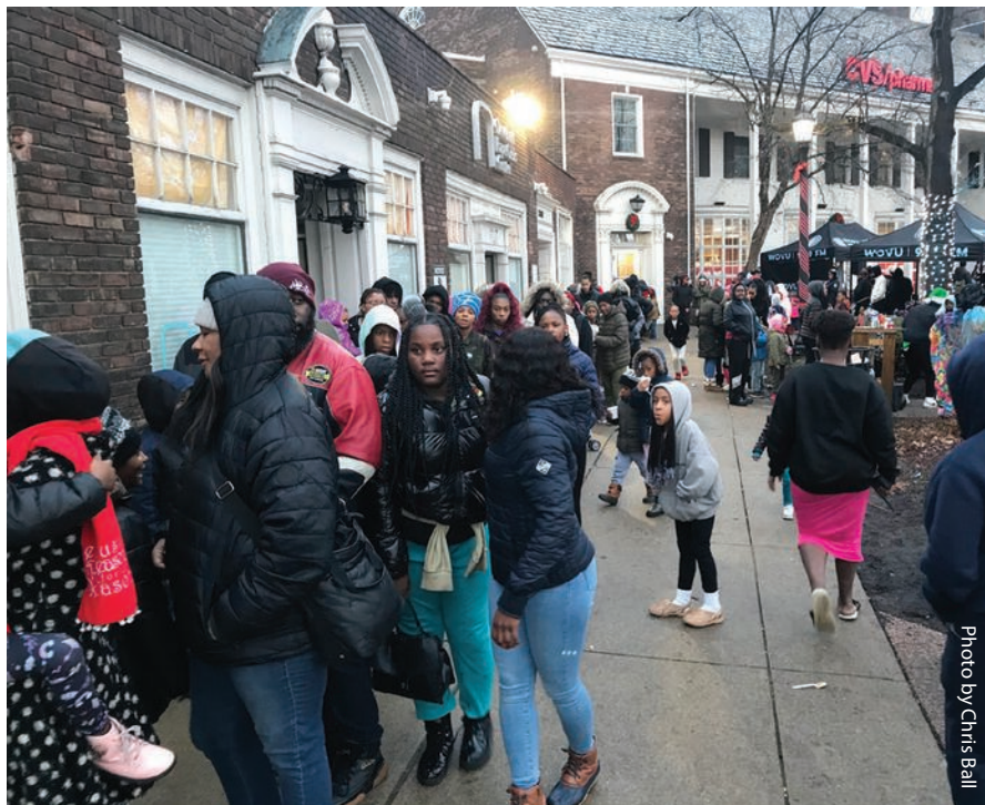
Organizers estimate that 1,000 people showed up for the fifth annual "$10,000 Toy Giveaway" Dec. 17 on Shaker Square.

"We share a few words of encouragement with them, let them know we've all come through the community of hard knocks," he said. "We still are committed to the community. We just wanted to let them know that people who were in the same shoes are just a step away, and we still are thinking of them and any bridge we can create to help them come into a different reality. That's what we're here for."