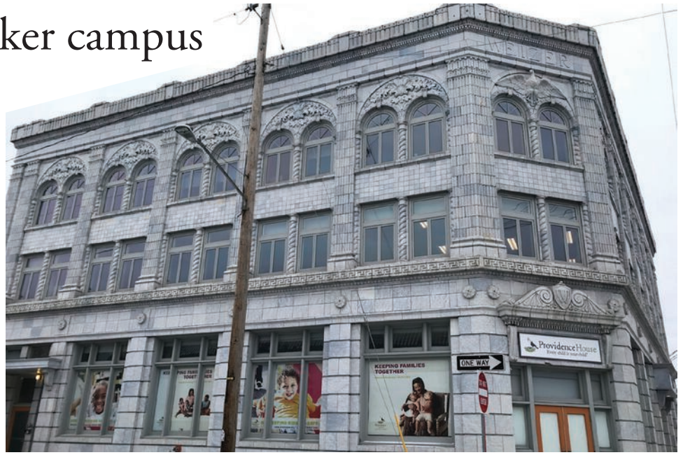
Providence House renovated the vacant Weizer building on Buckeye Road for its new East Side campus, called Hope's House.