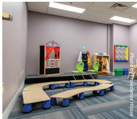
Hope's House includes a spacious children's playroom.

The nonprofit agency is committed to child abuse prevention and family preservation by providing for children's physical, emotional, developmental, and educational needs. It supports families by connecting them to resources, cultivating nurturing practices, and offering individualized parent education, counseling, case management, and trauma services to support long-term family stability.