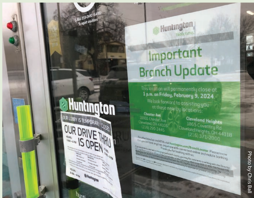
A notice on the back door announces the Feb. 9 closing of Huntington Bank's Buckeye branch.